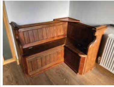
Bespoke furniture design and manufacturing