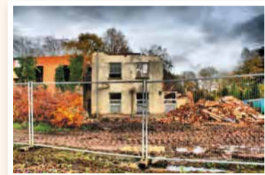
Small to Medium sized demolition projects and strip-outs.