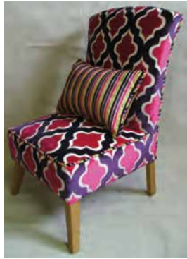
Furniture restoration and upholstery