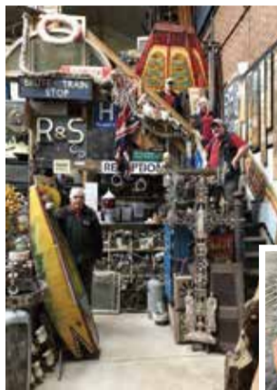
Dedicated family business