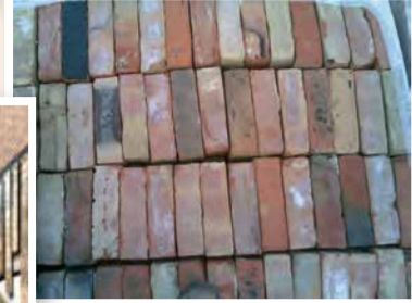
Brick identification and sourcing