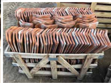
Roofing tile identification and sourcing